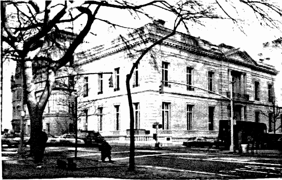
The James B. Duke House, designed by Horace Trumbauer (1912), at 78 th Street and Fifth Avenue, now home of New York University's Institute of Fine Arts, which underwent some exterior construction in December: Site of 1997 ARLIS/NY Holiday Meeting (more on p. 4)