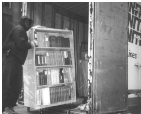
A mover from Clancy-Cullen with a shrink-wrapped cart full of periodicals.

After a busy spring and summer unpacking and cleaning up, I've been busy ever since buying books, planning services, and establishing policies. New forms and spreadsheets are in place, and a nice slick brochure is in the drafting stages. A book sale is planned for October 16 and 17 to raise funds from the many duplicates that I have recently de-accessioned.